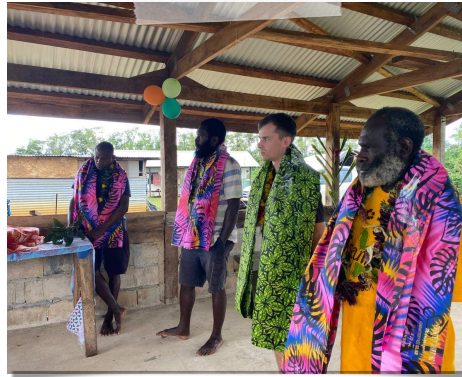
Receiving gifts at the Thank-You ceremony