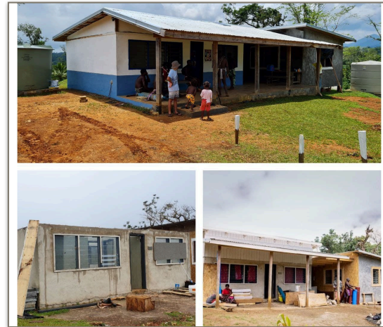
Top: Clinic after remodeling, Bottom showing during and before the storm

We have finally concluded the repair and upgrade of the clinic in Selei! We were able to rebuild it so it can withstand upcoming cyclones, install solar lighting around the facilities and provide water access inside. We are thankful for the service of our two nurses Fiona and Miriam, who have served the community in Selei faithfully, while enduring many difficulties and resistance.