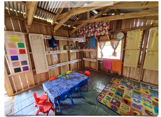
Inside the Kindergarten

This year we were able to launch a Christian Kindergarten at Selei, with Estella serving faithfully as the teacher. They are currently using a small 3x5 meter room, but we are getting ready to build a separate building and playground in order to be able to take in more children. The local chiefs gave us permission to cut down and use hardwood trees for all further construction and the building of the school. This will aid our mission base greatly, as we will be able to utilize local materials in the future. We were able to purchase and order a professional